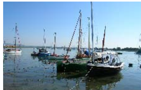
DCA Moorings at Cobnor