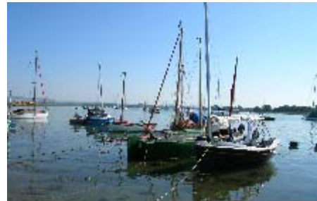
DCA Moorings at Cobnor