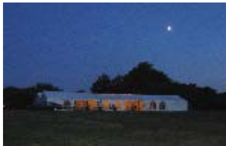
End of a perfect day By Sue Forster

My idea is to arrive just before the tide leaves the island, around 12.30 and have a bar-b-que lunch. – so - bring some sausages or spuds to bake. If you could also bring some kindling then, when it gets dark we can have a pow wow round a bonfire. Sufficient kindling can sometimes be found on the island, but there havn't been any storms lately so it has probably all been used over the Summer.