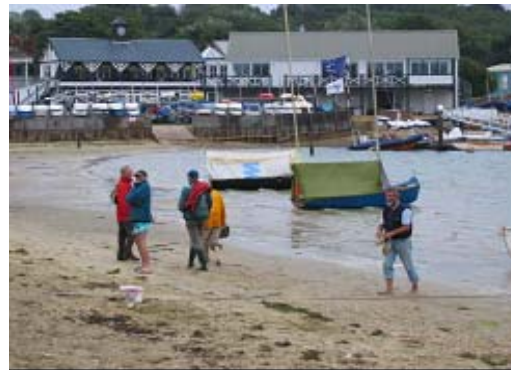
Setting-out for Baywatch restaurant.